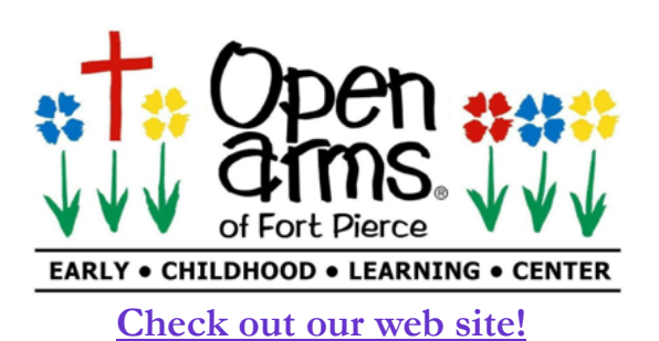
We want to thank you for all of your support