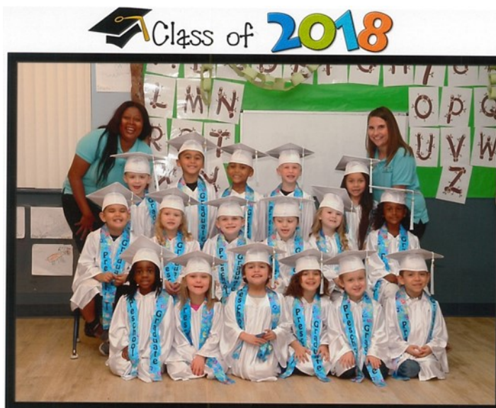
Open Arms of Ft. Pierce