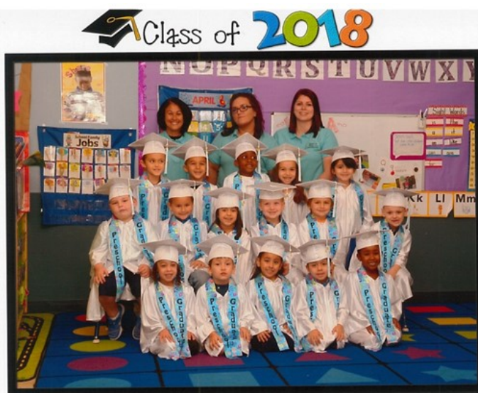
Open Arms of Ft. Pierce.

Congratulations to the VPK - A Open Arms Class of 2018!