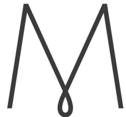
Ft Pierce MOPS

MOPS is what you need! Join us here at Trinity again on Tuesday, October 10 and 24, 10 am-12 pm. MOPS is for all Moms with children from pregnancy through Kindergarten. It's a place for friendship authentic community, support and growth—because Better Moms Make a Better World! MOPS Kids Childcare is provided.