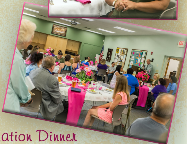
Open Arms Staff Appreciation Dinner